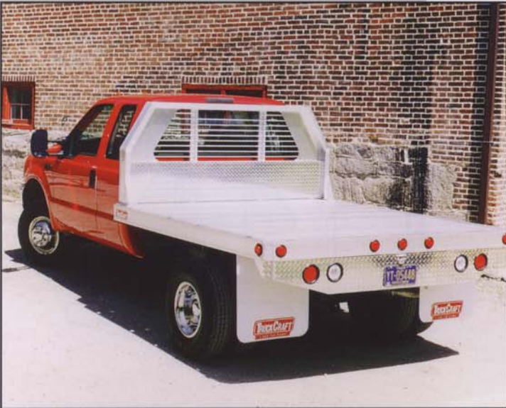
Model 94x9 with optional Cab Guard & Tailboard